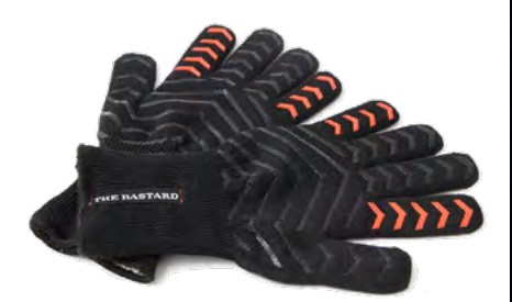
THERMO GLOVES // BB035