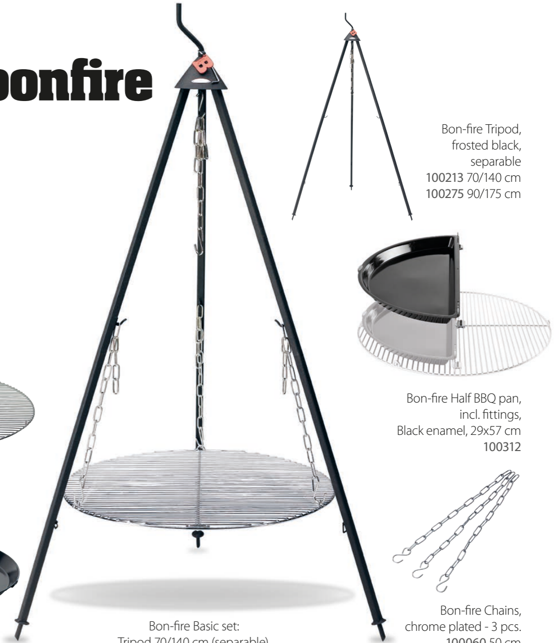
Bon-fire Basic set: Tripod 70/140 cm (separable), Grill grid Ø60 cm, chains 50 cm 110021