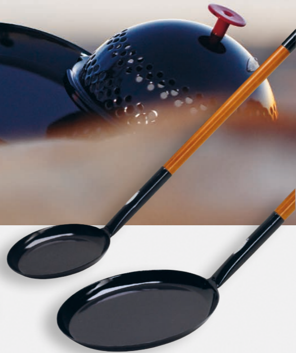
Bon-fire Pancake pan w. separabel wooden handle, 130 cm, black enamel 100091 Ø20 cm 100251 Ø28 cm