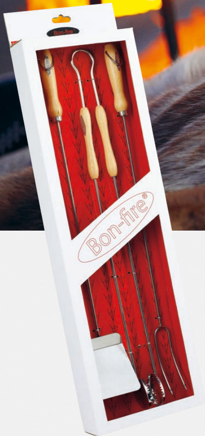
Bon-fire Tool Set: Palette, Fork, Tweezers 300286