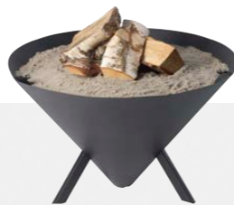
Bon-fire "CONE" Brazier, Ø77 cm incl. fittings for tripod, H: 49 cm, black powder coating 100336