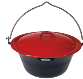
Bon-fire Stew pot w. lid, black/red enamel 100022 6L 100039 8L 100114 15L