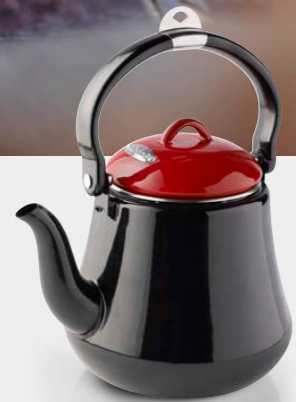
Bon-fire Coffee/Tea pot 2,2L, black/red enamel 100176