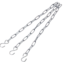
Bon-fire Chains, chrome plated - 3 pcs. 100060 50 cm 100145 60 cm