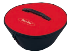
Bon-fire Bag for 6L stew pot 400115