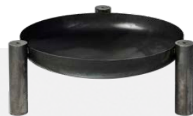
Bon-fire Brazier "2019" in steel H: 30 cm 100343 Ø70 cm 100350 Ø80 cm