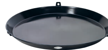
Bon-fire BBQ pan, black enamel, Ø60 cm 100084