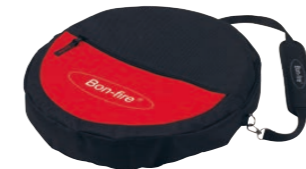
Bon-fire Folding dustbin w. a pole, nylon incl. Transport bag 400061