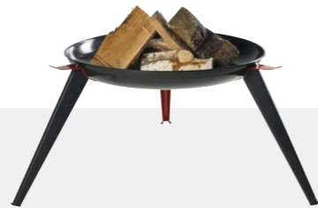
Bon-fire Brazier, Ø68 cm w. long legs (50 cm), incl. fittings for tripod, black enamel/powder coating 100305