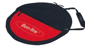
Bon-fire Bag for 60 cm grill grid 400108