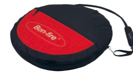
Bon-fire Bag for BBQ pan 400092