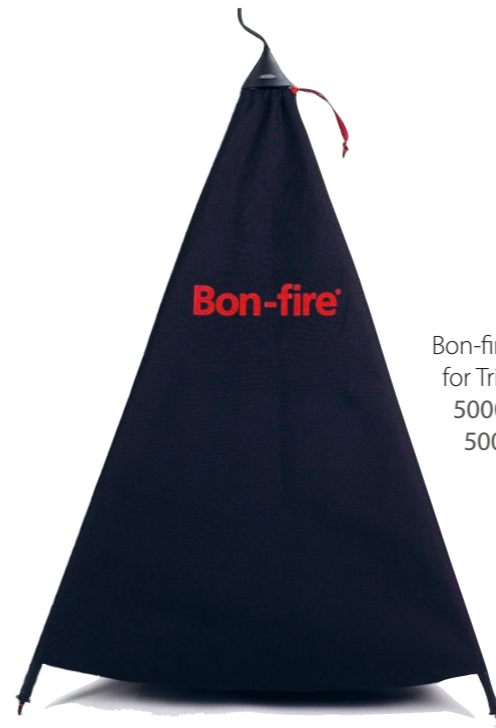
Bon-fire Tipi (cover) for Tripod 500013 140 cm 500020 175 cm