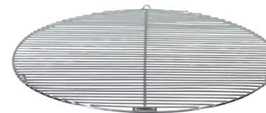
Bon-fire Grill grid, chrome plated 100077 Ø60 cm 100138 Ø70 cm