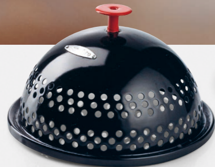
Bon-fire Poptop Popcorn net, black/red enamel 100183 Ø20 cm 100282 Ø28 cm