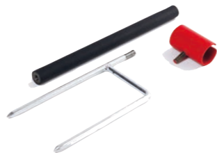
Bon-fire Holder w. a pole, for twist bread stick, black/red powder coating 100220