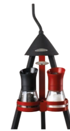
Bon-fire Spice rack with 2 spice mills, red/black 400139