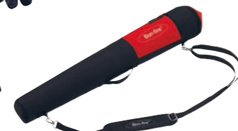
Bon-fire Bag for separable Tripod 400085