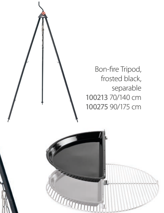
Bon-fire Half BBQ pan, incl. fittings, Black enamel, 29x57 cm 100312